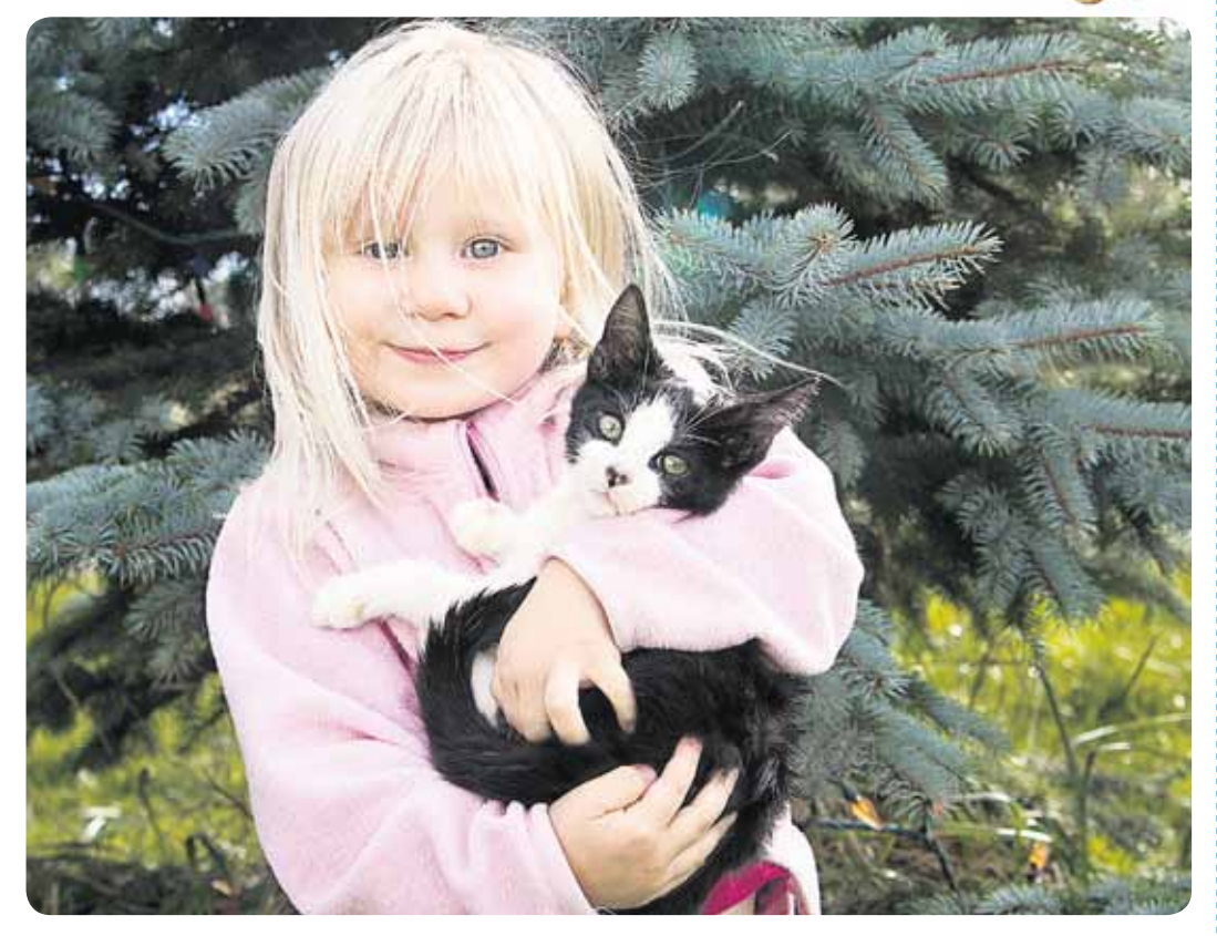
Pets are an inseparable part of life in New Zealand. So much so, that nearly 70 percent of Kiwi homes also house some form of companion creature.

Surveys show the No. 1 reason we love our pets is for their companionship. But it also turns out that we love them almost as much for the joy they bring to the lives of our children